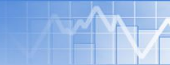
Sample questionnaire for GVC firms